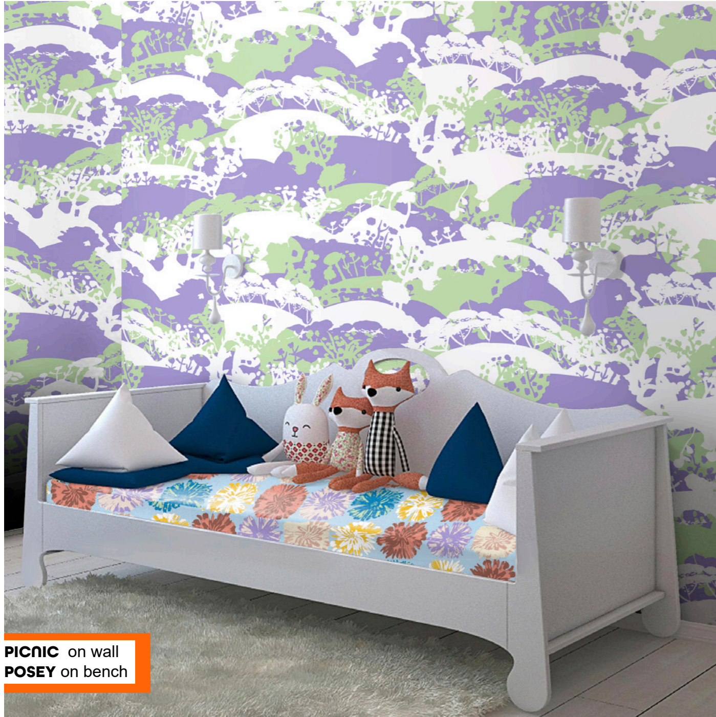
PICNIC on wall POSEY on bench