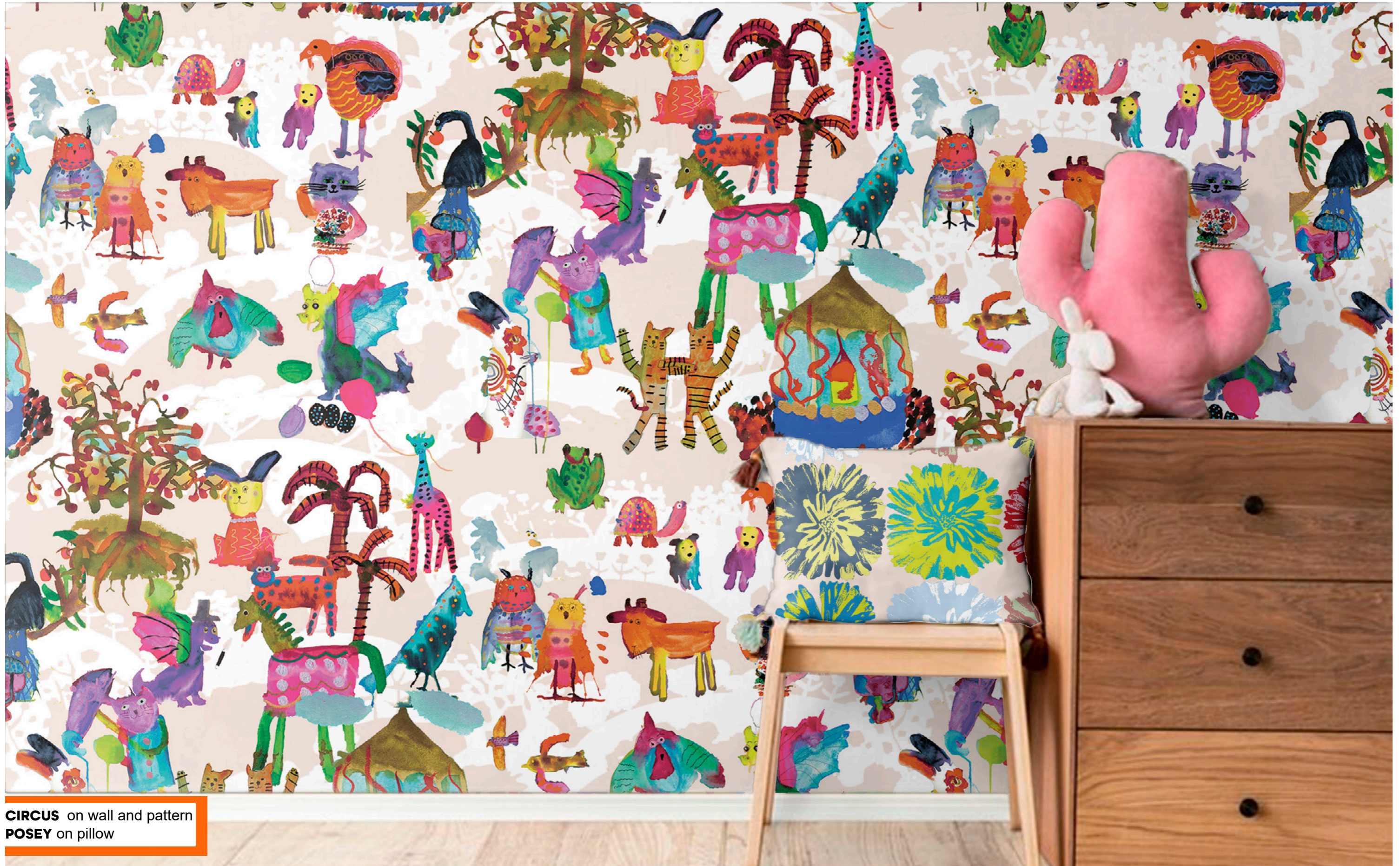
CIRCUS on wall and pattern POSEY on pillow