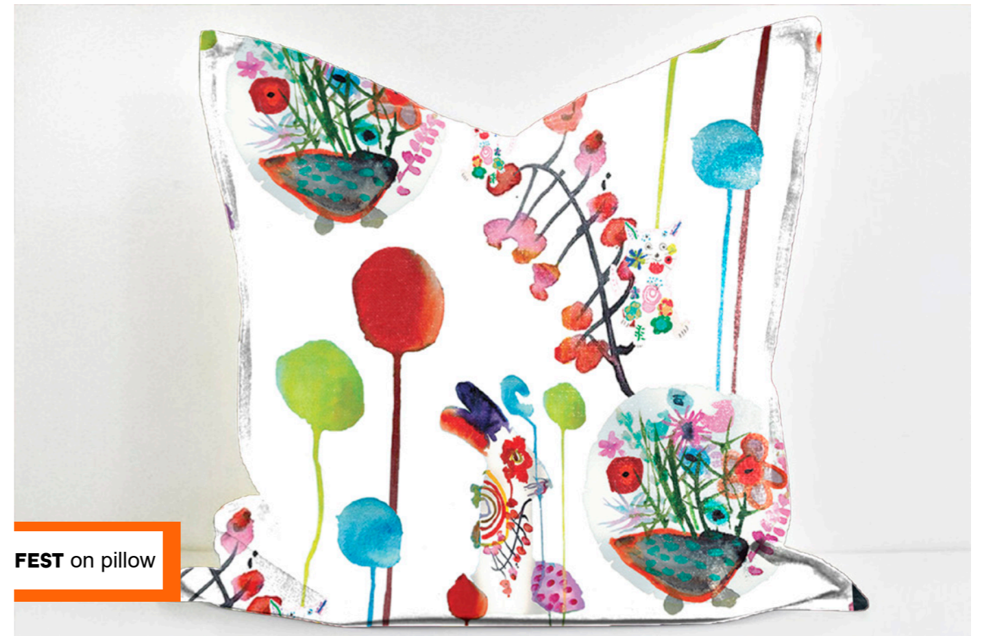
FEST on pillow