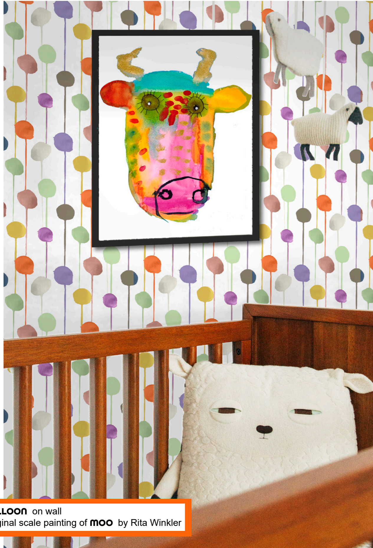
BALLOON on wall Original scale painting of MOO by Rita Winkler