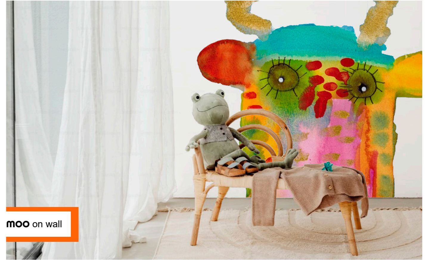
MOO on wall