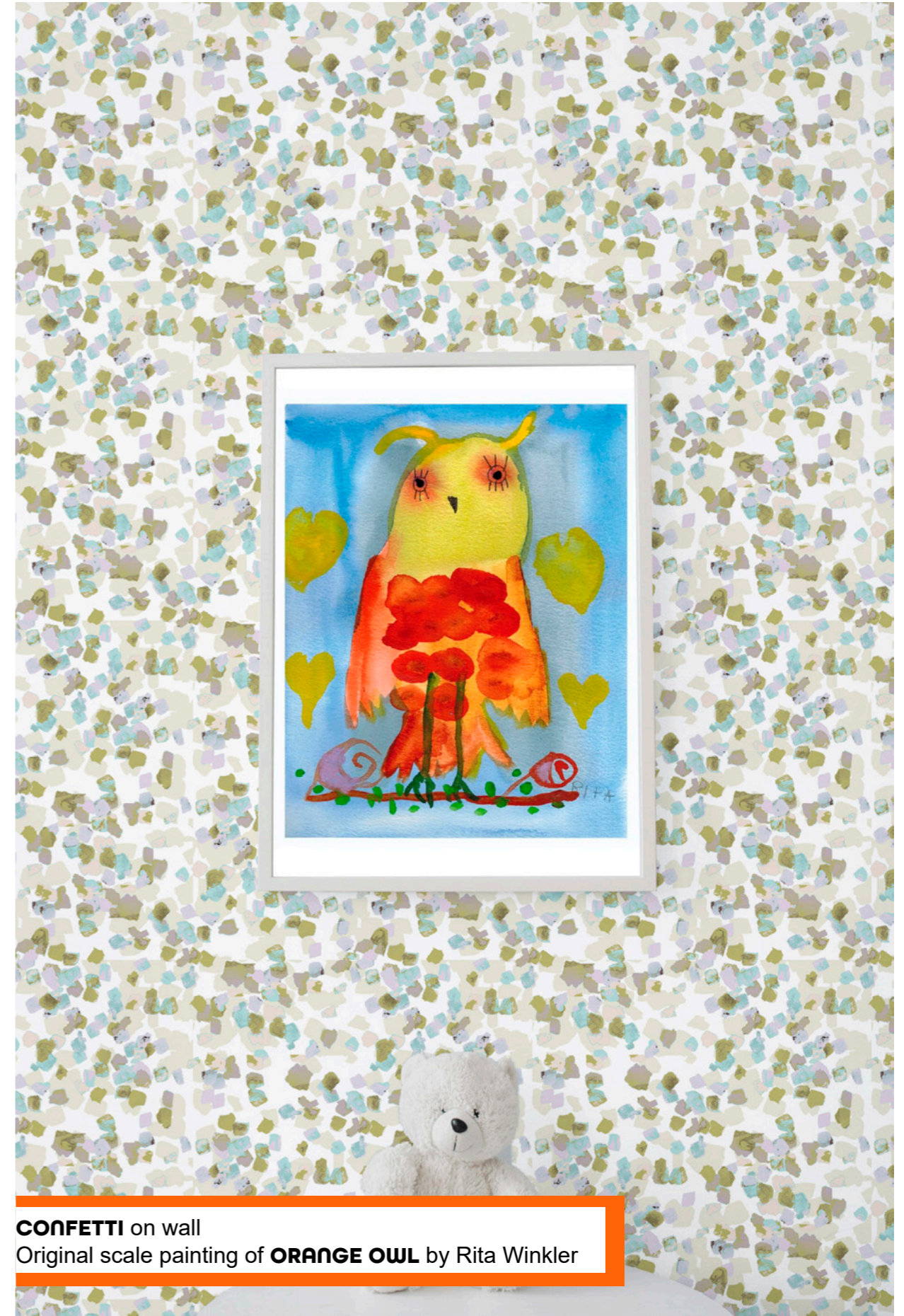
CONFETTI on wall Original scale painting of ORANGE OWL by Rita Winkler